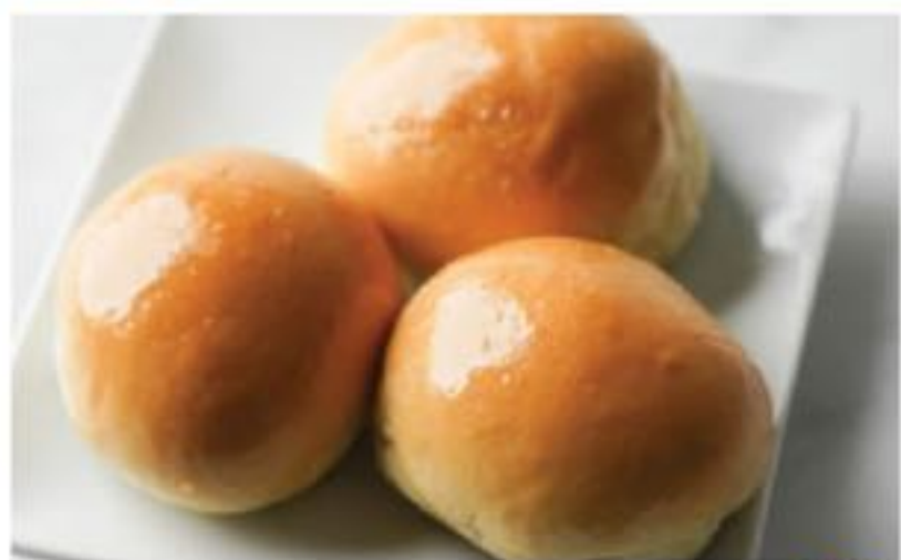
焗叉燒包 M Baked BBQ Pork Bun