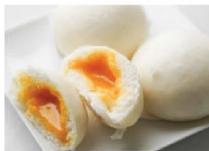
奶皇包 Custard Bun