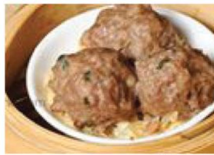
陳皮牛肉 M Beef Meatball