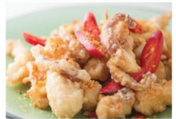
椒鹽鮮魷 K Salt & Pepper Squid