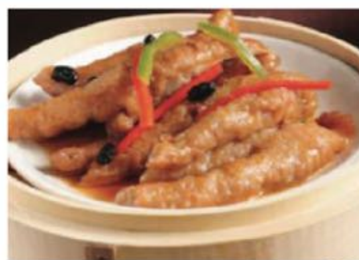
豉汁蒸鳳爪 Chicken Feet