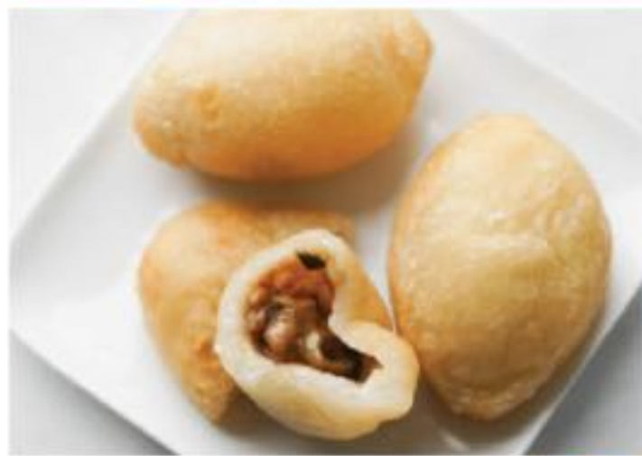
咸水角 M Fried Pork Dumpling