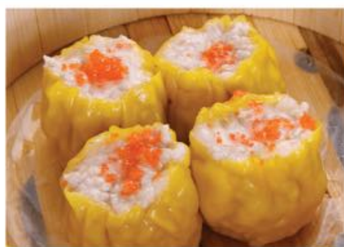
燒賣 Siu Mai