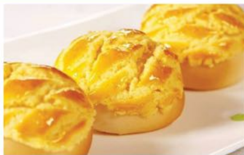
焗菠蘿包 M Baked Pineapple Bun