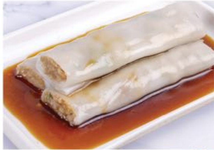
牛肉腸粉 L Beef Rice Roll