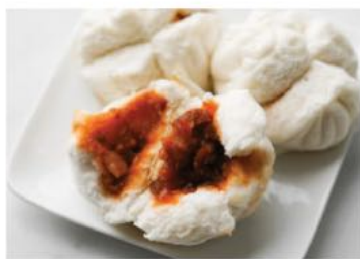
叉燒包 BBQ Pork Bun