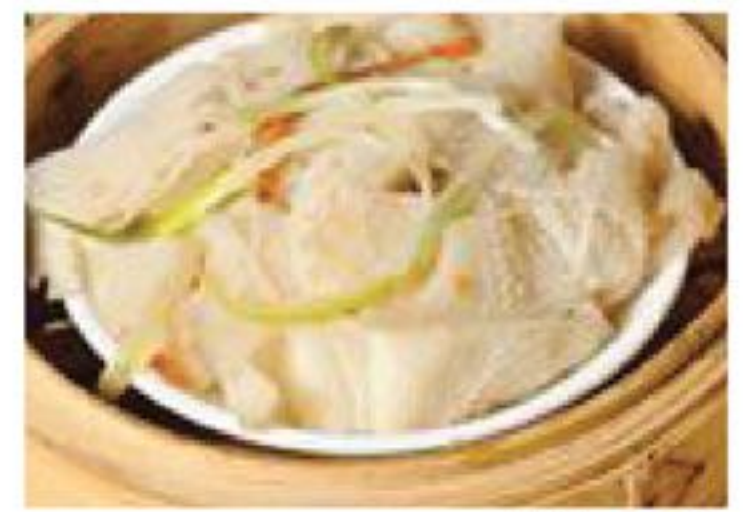
牛柏葉 M Beef Tripe