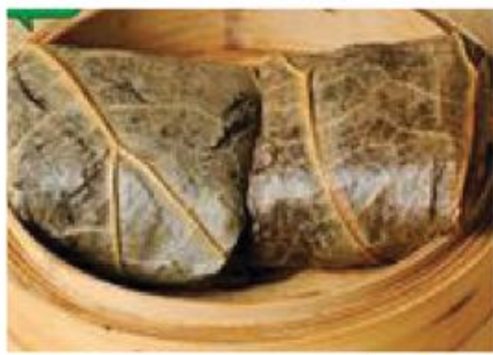
糯米雞 L Lotus Leaf Sticky Rice