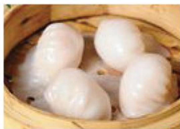
蝦餃 Shrimp Dumpling