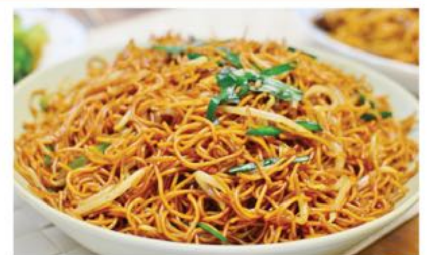
豉油皇炒面 K Supreme Soy Sauce Chow Mein