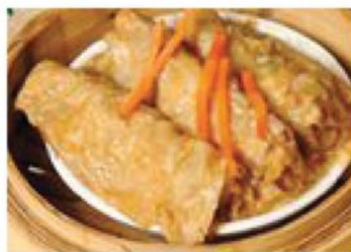
鮮竹卷 Beancurd Skin Roll