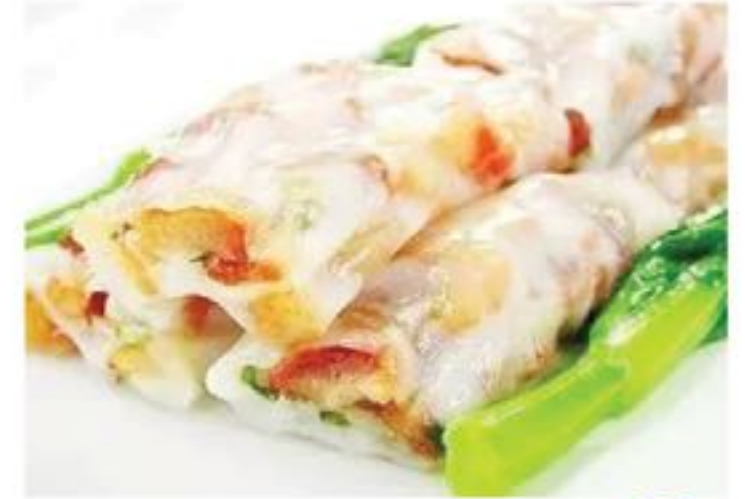
金沙蝦腸粉 K Golden Shrimp Rice Roll