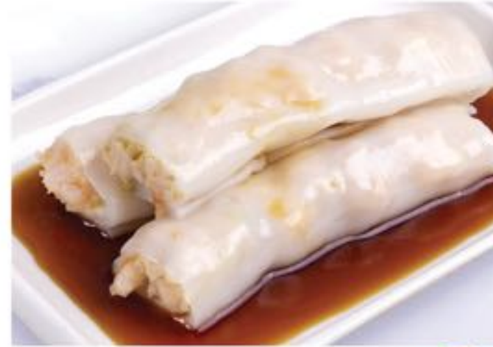
鮮蝦腸粉 L Shrimp Rice Roll