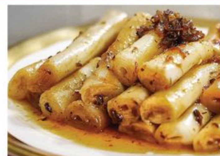
XO醬炒腸粉 K XO Sauce Rice Roll