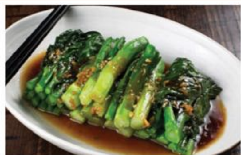
蠔油芥蘭 K Oyster Sauce Chinese Broccoli