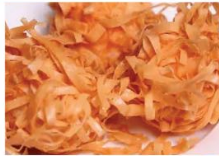
百花炸蝦球 L Fried Shrimp Ball