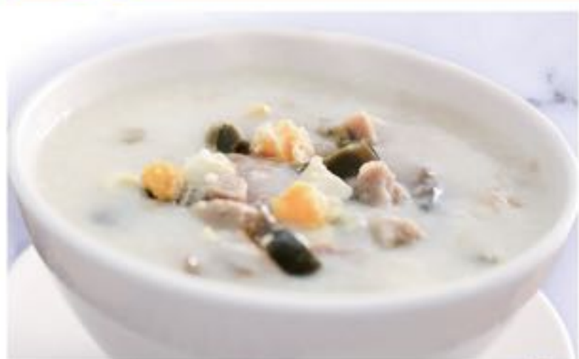
皮蛋瘦肉粥 K Preserved Egg w/ Pork Porridge