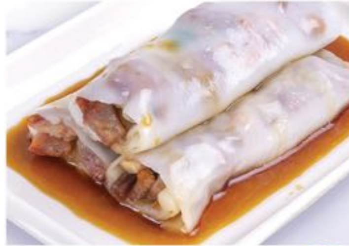
叉燒腸粉 L BBQ Pork Rice Roll