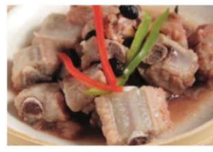
豉汁蒸排骨 Black Bean Sauce Ribs