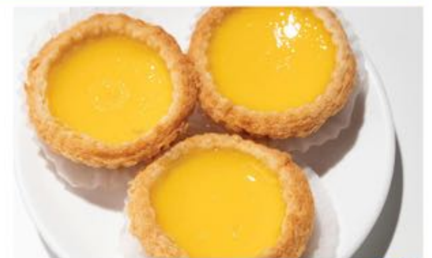
蛋撻 M Egg Tart