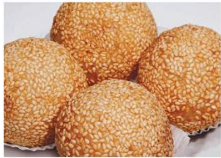
煎堆 S Fried Sesame Ball