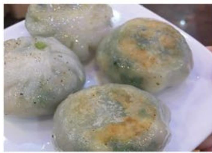
韭菜餃 L Shrimp & Chive Dumpling