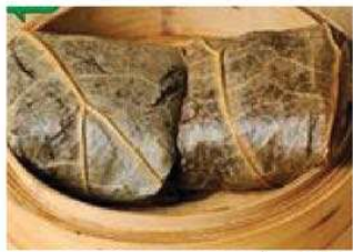
糯米雞 L Lotus Leaf Sticky Rice