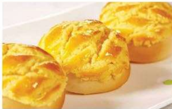
焗菠蘿包 M Pineapple Bun