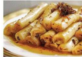
XO醬炒腸粉 K XO Sauce Rice Roll