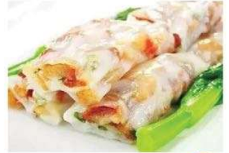
金沙蝦腸粉 K Golden Shrimp Rice Roll