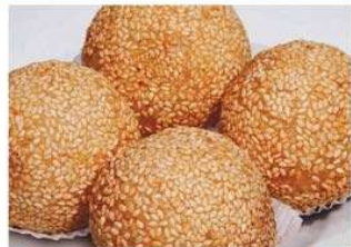
煎堆 S Fried Sesame Ball