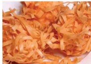
百花炸蝦球 L Fried Shrimp Ball