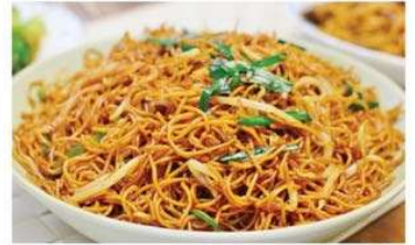
豉油皇炒面 K Supreme Soy Sauce Chow Mein