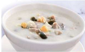
皮蛋瘦肉粥 K Preserved Egg w/ Pork Porridge