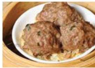
陳皮牛肉 M Beef Meatball