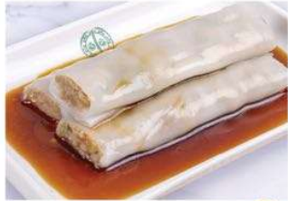
牛肉腸粉 L Beef Rice Roll