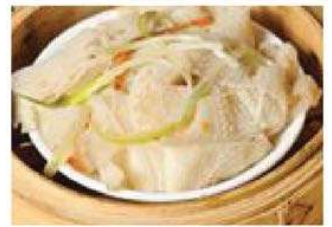
牛柏葉 M Beef Tripe