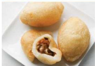
咸水角 M Fried Pork Dumpling