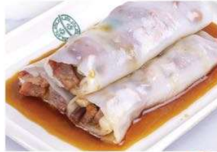
叉燒腸粉 L BBQ Pork Rice Roll