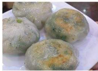
韭菜餃 L Shrimp & Chive Dumpling