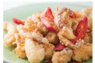
椒鹽鮮魷 K Salt & Pepper Squid