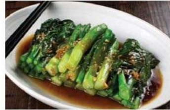
蠔油芥蘭 K Oyster Sauce Chinese Broccoli