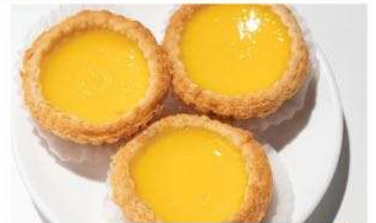
蛋撻 M Egg Tart