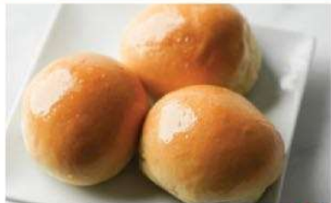
焗叉燒包 M Baked BBQ Pork Bun