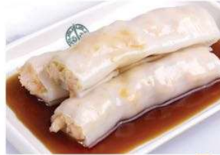
鮮蝦腸粉 L Shrimp Rice Roll